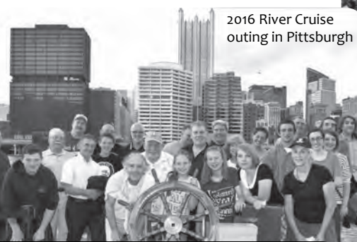
2016 River Cruise outing in Pittsburgh