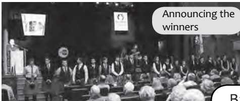
Announcing the winners