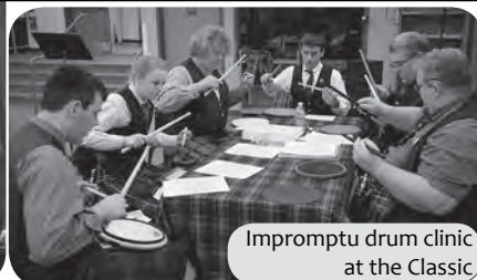
Impromptu drum clinic at the Classic