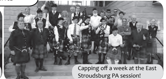
Capping off a week at the East Stroudsburg PA session!