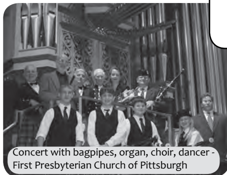
Concert with bagpipes, organ, choir, dancer - First Presbyterian Church of Pittsburgh